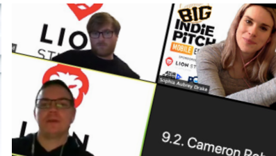
Big Indie Pitch judges seats