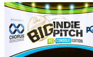
Big Indie Pitch sponsorship