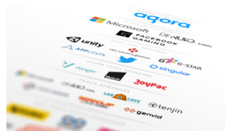
Email sponsorship placement